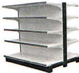
Sample picture of a rack.